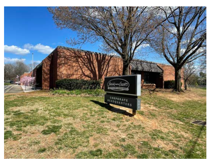
Structural Steel + Brick Construction