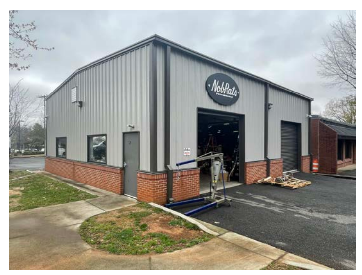
1,800 SF Mechanical Garage