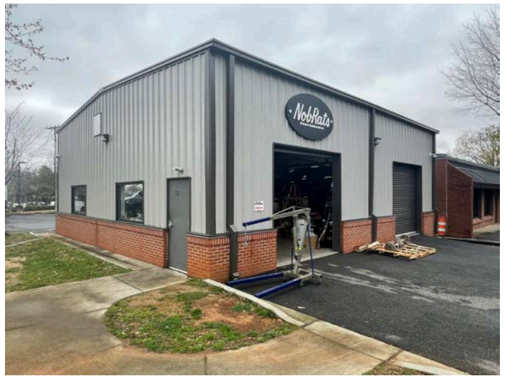
1,800 SF Mechanical Garage