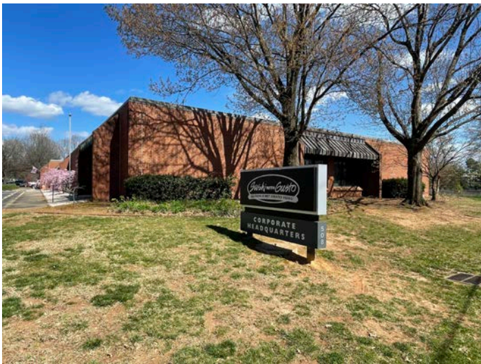
All Brick Construction